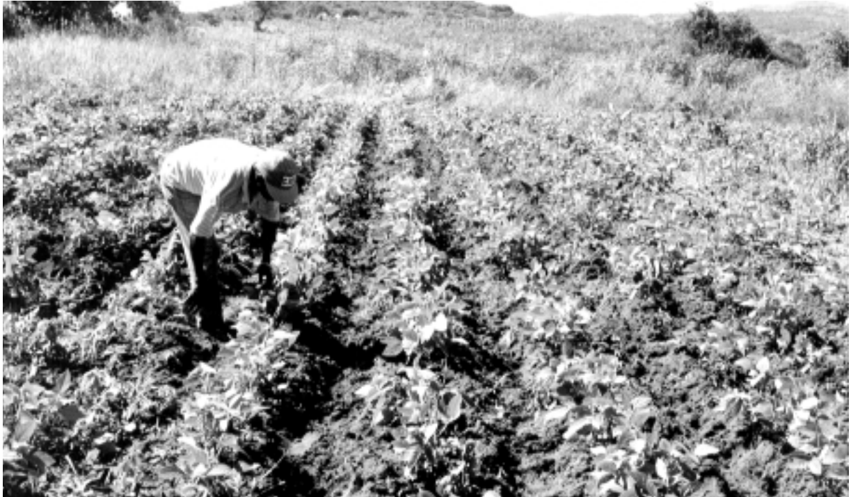
Soya field at Ringili Demonstration Farm weeded using two oxen and a cultivator

recommended that row spacings are standardised so that only two yokes are required. These could correspond to the small and large yokes needed for plowing and carting, respectively. The recommended spacing could be, for example, 80 cm for maize, sunflowers and sorghum, and 40 cm for beans, soya bean, millet and groundnuts. This would require yokes of 220 and 140 cm, respectively.