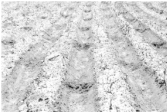
Photo 2: Effect of ridge tying as a weeding operation. Weeds in the furrow and on the flanks are controlled with the tying operation

The conventional marketing approach would clearly not be successful for the new toolframe, so a decentralised approach was developed. The workshop which was involved in the design of the toolframe was able to manufacture for the local market. The owner of this workshop was also willing to market the implements on his own. Several merchants from rural areas who frequent his workshop showed interest and started to sell the implements in their own stores. To reach a wider group of communal farmers, a brochure was produced, with descriptions in vernacular and simple drawings (an example is shown in Figure 1) of the toolframe and other implements designed by the ConTill Project. These have been designed to be distributed through various outlets and through agricultural extension workers.